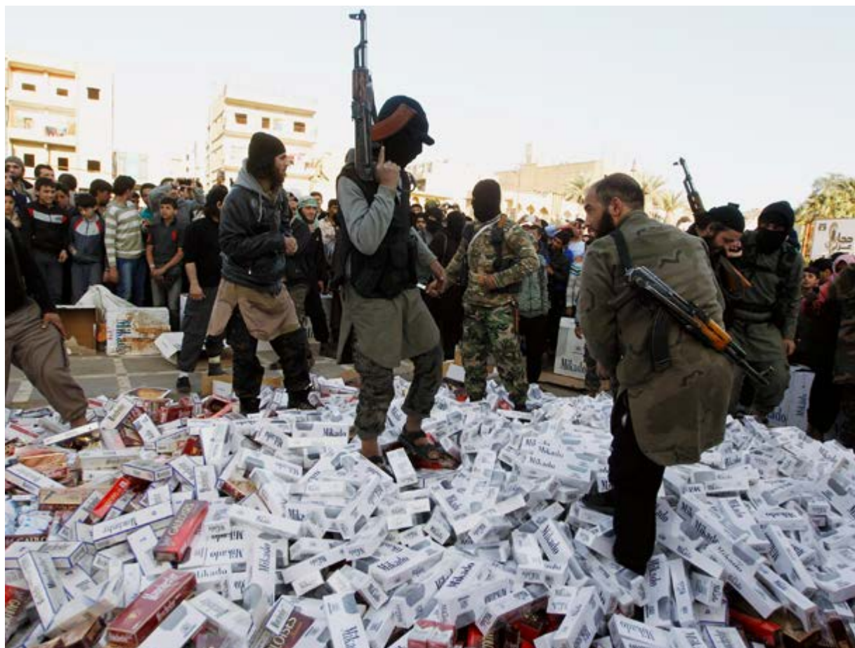
Confiscated cigarettes: IS derives its funding from the illegal tobacco trade, but it does not penalise authorised smuggling.

“non-traceable communications, forgers, and money launderers”. 37 Without hiring this expertise, they cannot make their business function. 38