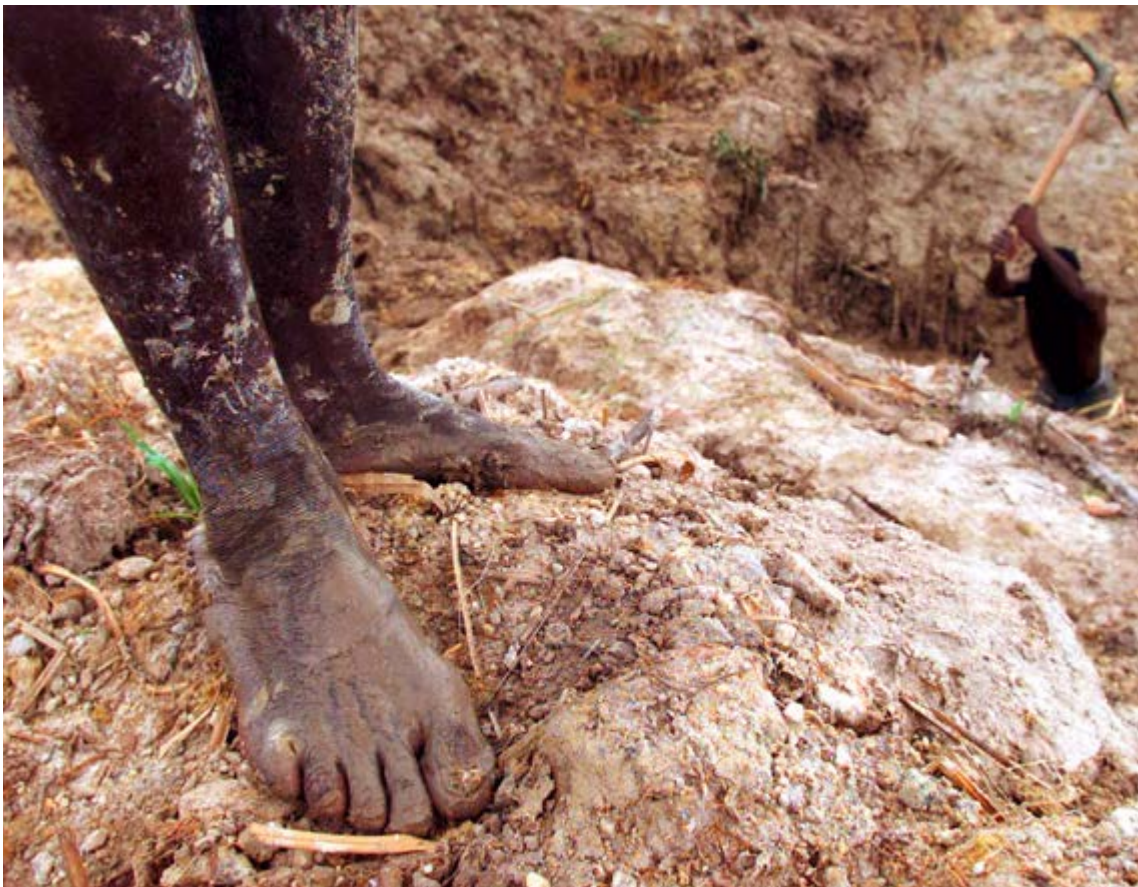
Mineworkers in Sierra Leone: Terrorist organisations are keen to make use of whatever resources they may find.

All terrorist groups do not function the same way in business. Cultural, historical and geographic conditions shape their approach to terrorist financing. For example, in the Middle East where trade has been at the heart of the economy since the first recorded language, trade or taxing trade is the major funding source of IS and other groups such as the PKK operating in the region. Trade-based money laundering is an important means to move money. 20 The