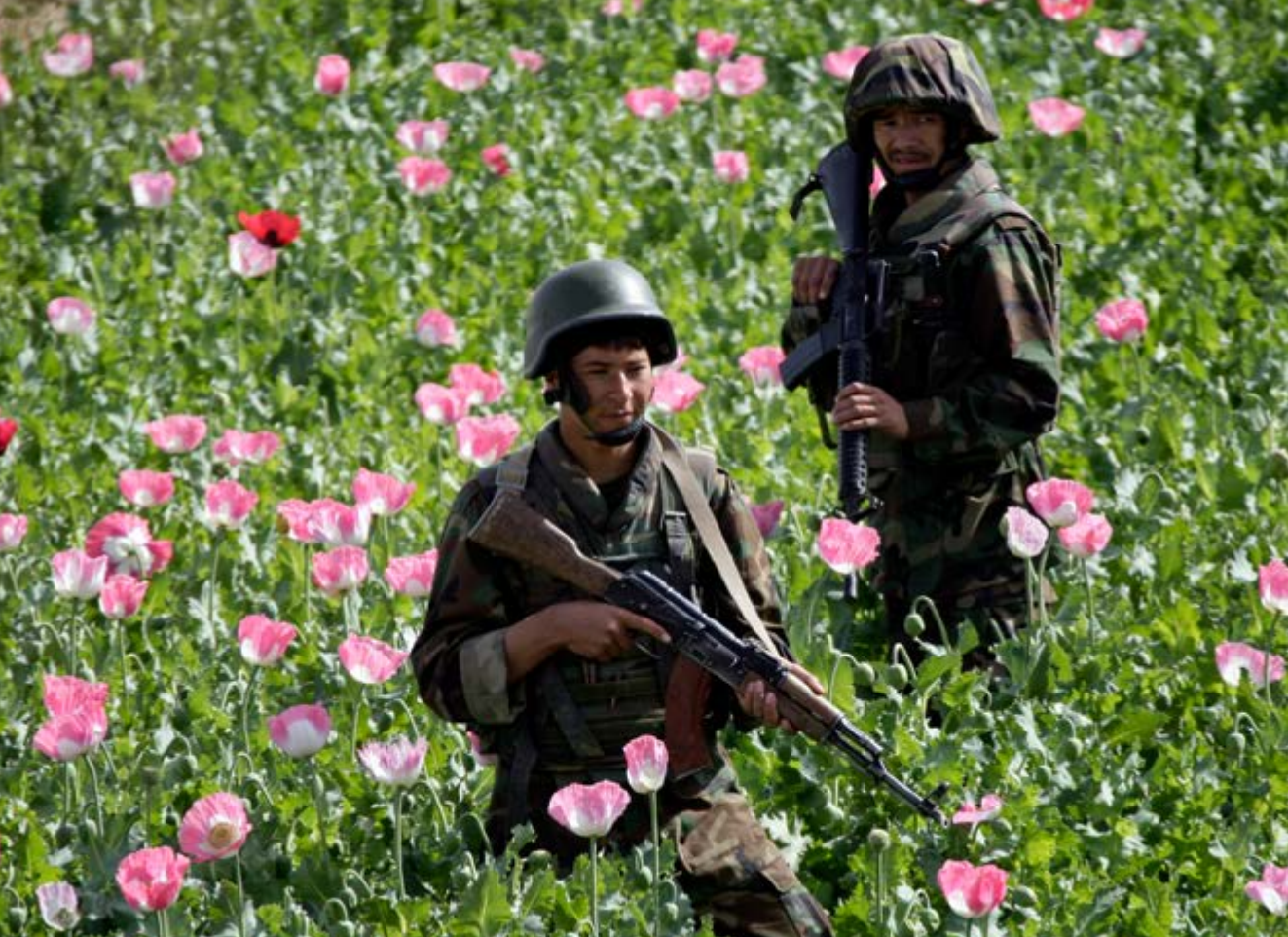
Poppy fields: Drug cultivation in Afghanistan was used by both al-Qaeda and the Taliban as a source of income.

long-standing growth of drugs in Afghanistan and in the Andes has contributed to a reliance on crop production and drugs when it comes to terrorist financing in these two diverse regions. 21