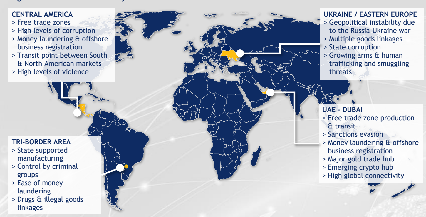
Figure 1: Location and key features of hubs of illicit trade

Depending on their specialization, hubs participate in production, transhipments, and consumption of various illicit goods and services. They can also perform enabling and supporting functions by providing money laundering and other