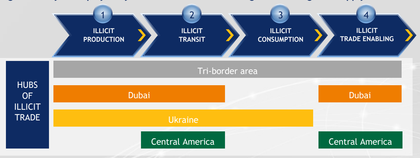
Figure 3: Key roles played by hubs of illicit trade in the global and regional supply chains

Hubs' distinct sets of functions depend on their competitive advantages and regional trade patterns existing in the globalized economy.